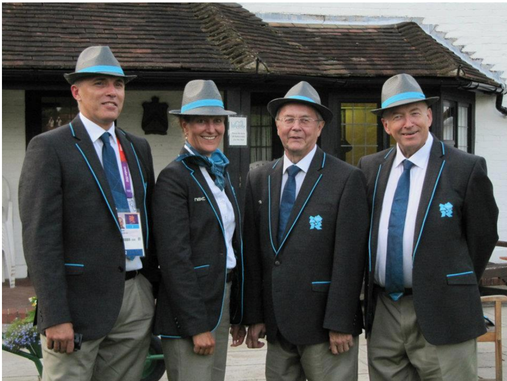
The Members of the Jury and the WA Technical Delegate – London 2012