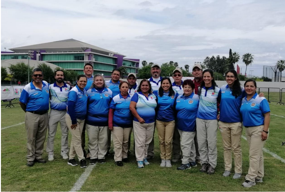
Mexican Grand Prix, Monterrey, Mexico, March 2019