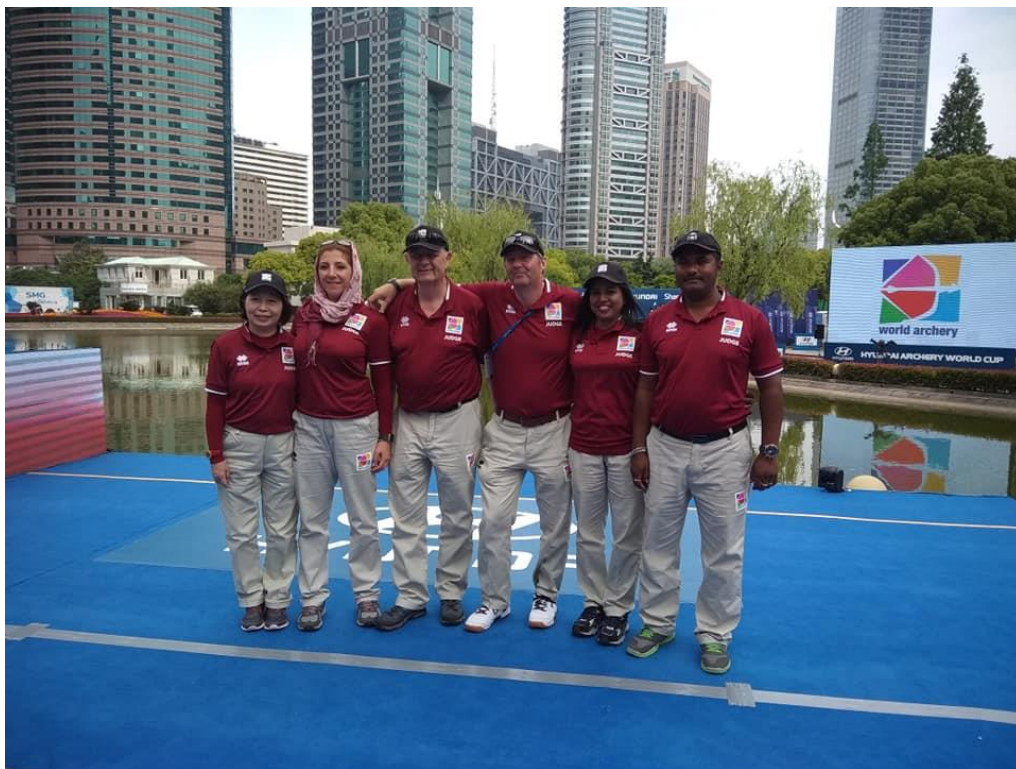
Hyundai World Cup Stage 2, Shanghai, May 2019