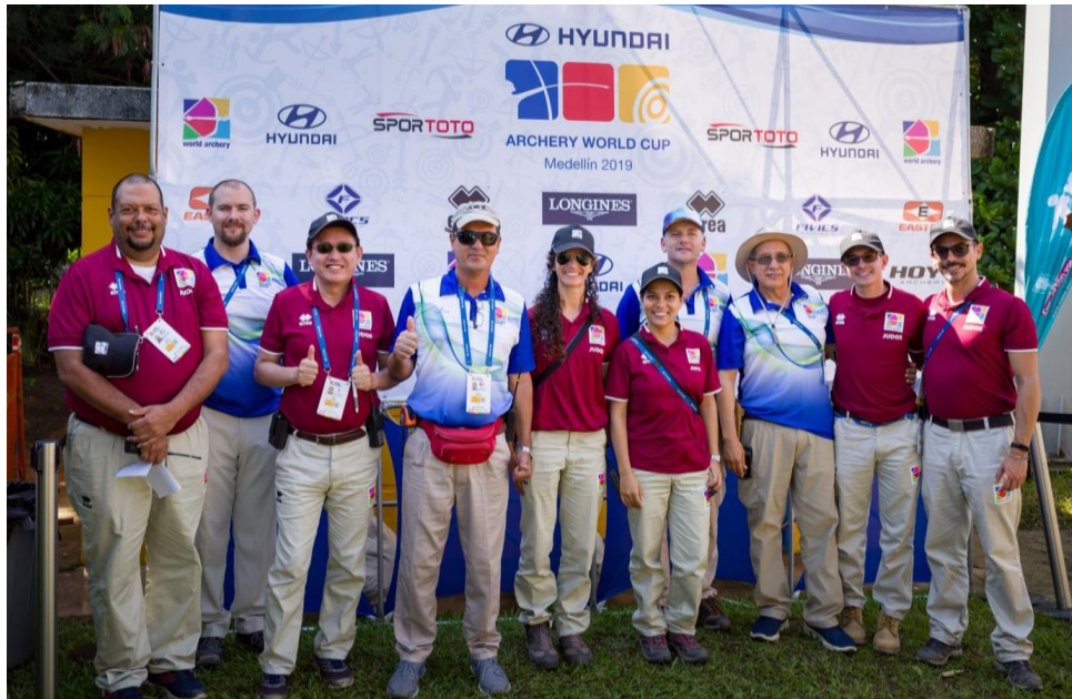
Hyundai World Cup Stage 1, Medellin, April 2019 – International and Continental Judges