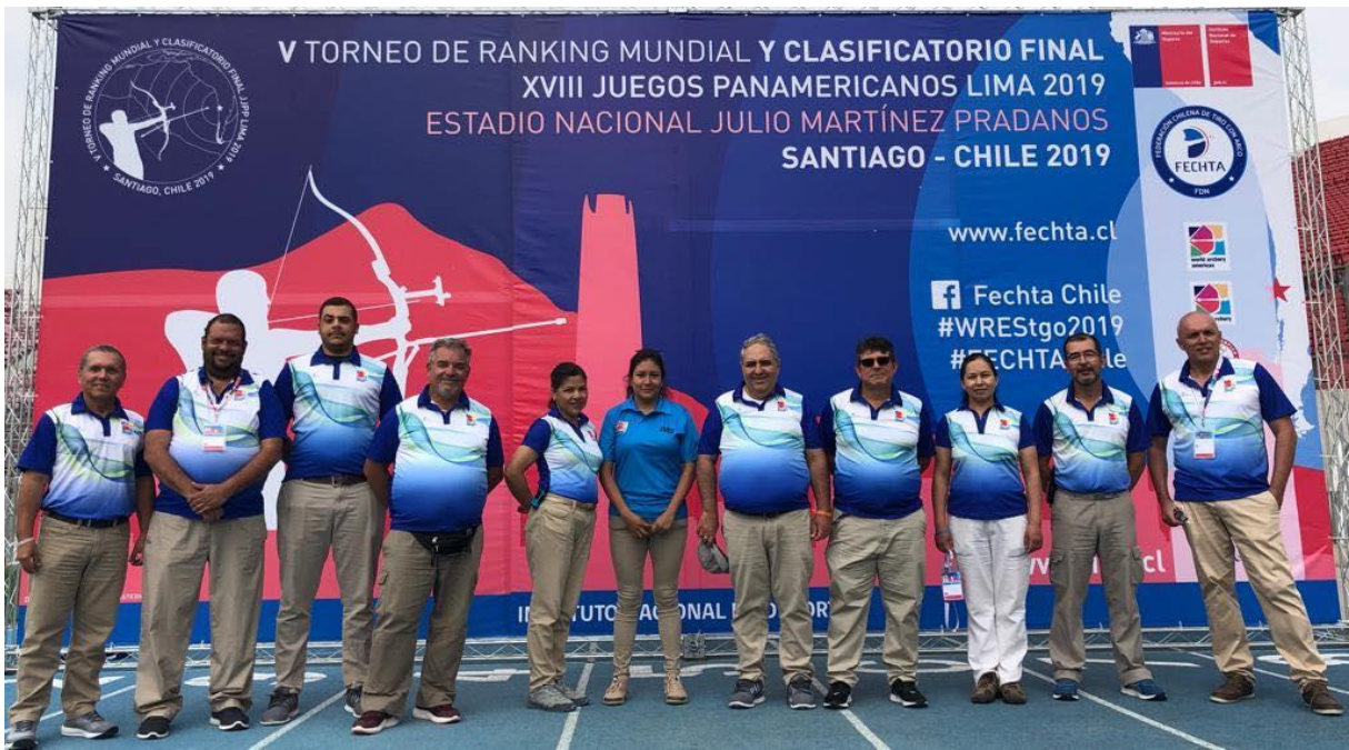
World Ranking Event, Santiago de Chile, April 2019