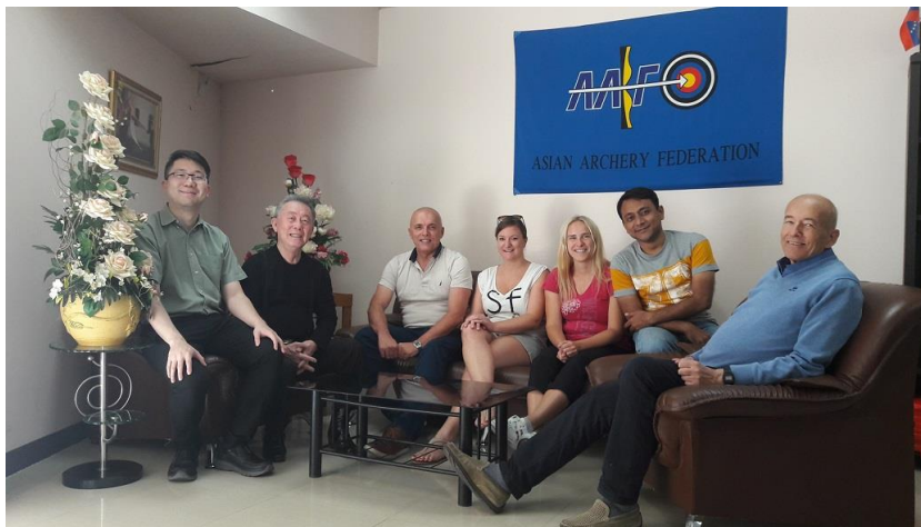
Judge Committee Meeting in Bangkok, 2017

It is extremely sad to hear this news. An unforgettable friend and teacher who was always happy to help. A true gentleman. RIP