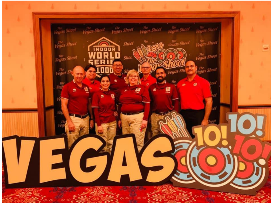
Las Vegas Indoor Series, 2019