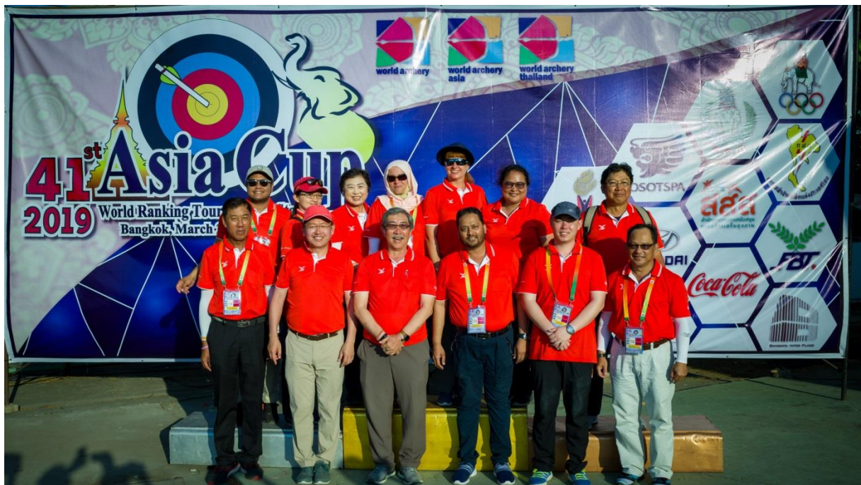
Asian Cup, Bangkok, March 2019