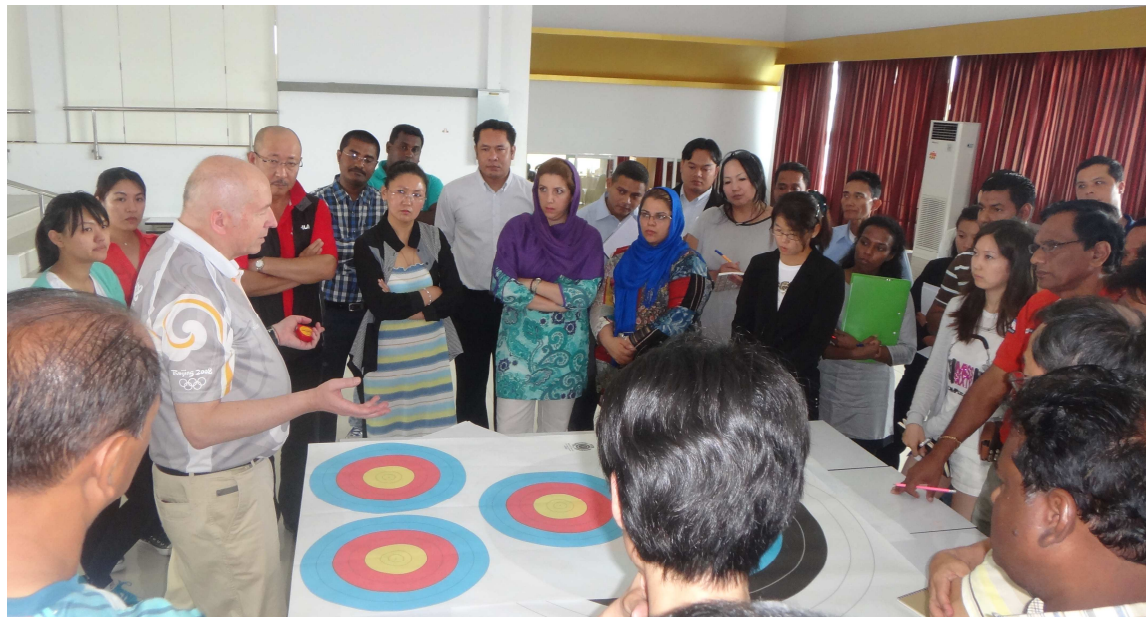
Your chairman explaining how to check target faces and what to look for.....

The following Continental Judges did well enough in the test to qualify as International Judge Candidates (46%)