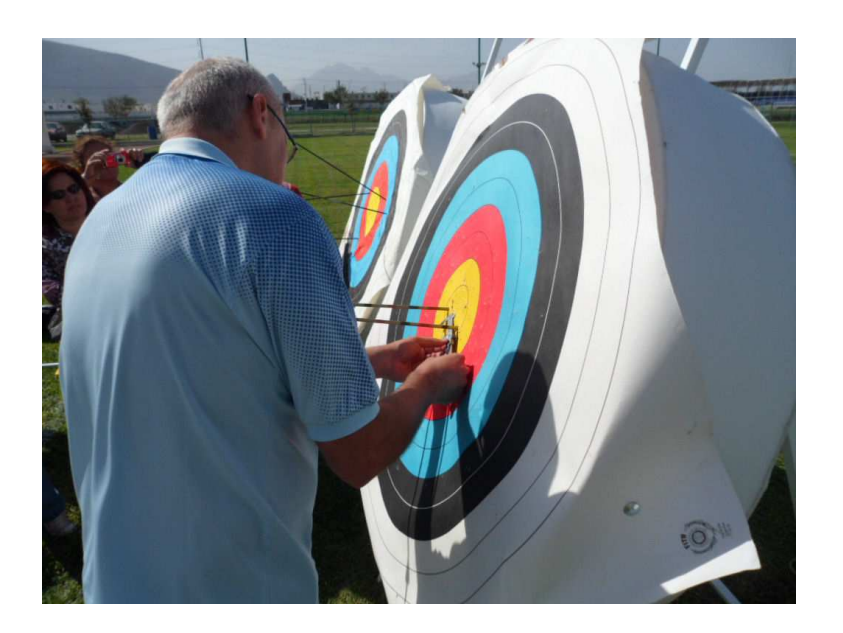
Demonstrating how to use a calliper to measure arrow distance to the centre of the target

World Archery Americas will carry out another Continental Judge Seminar this year. It will be held in Mar del Plata, Argentina (ARG), at the end of September, in the framework of the Open South American Championships.