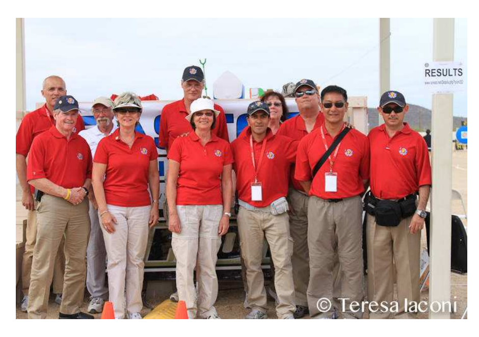
The officials at the 2012 Arizona Cup