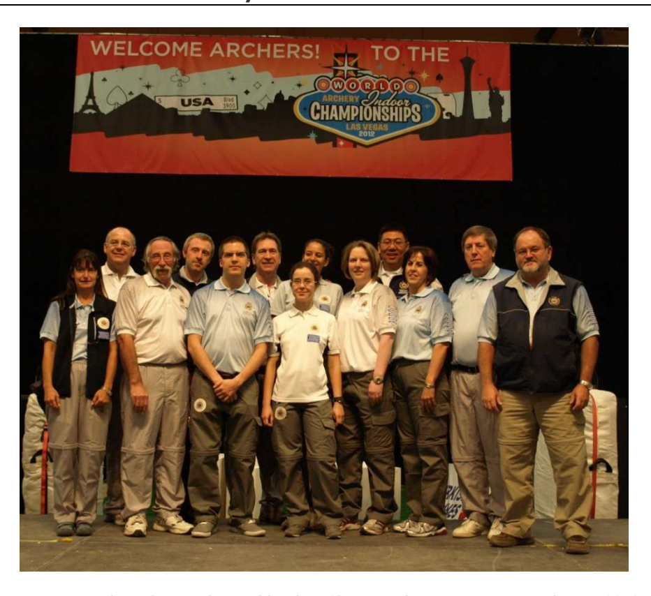
The judges at the World Indoor Championships in Las Vegas, February 2012