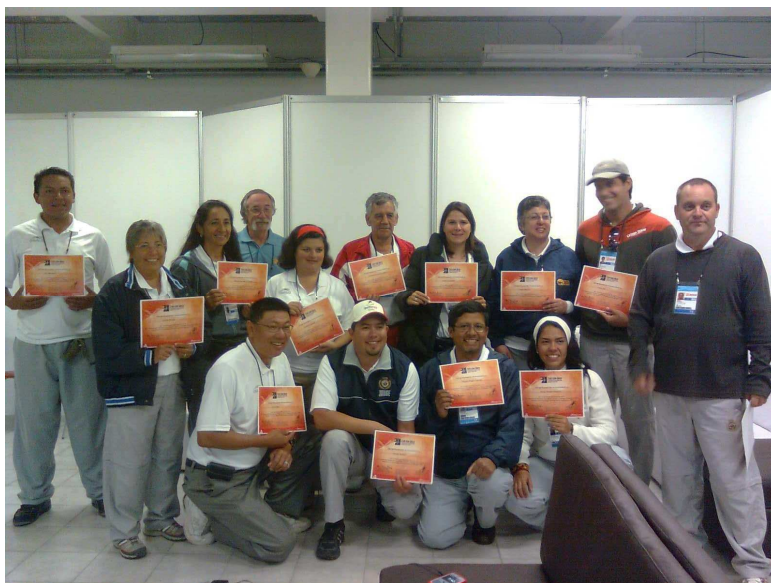
The judges at the Pan American