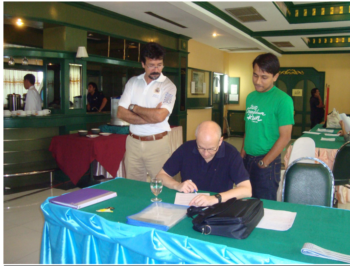
Is the chairman answering the test?