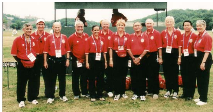
These other judges are just posing for a picture. Look how they smile. And they do carry large accreditation cards, which have become part of our uniforms. World Outdoor Target Championships, New York City, USA