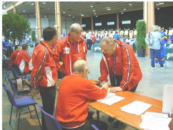
These judges are hard at work preparing for the equipment inspection. World Indoor Championships, Nîmes, France

2003 has been a very busy year for FITA Judges. Two large world championships were held in the course of this year: The World Indoor Championships, in Nîmes, France, and the World Outdoor Target Championships, in New York, United States of America. Our judges ensured the enforcement of the rules at these major events, working for long hours from morning to evening. Here are some pictures of our fellow judges at these two World Championships.