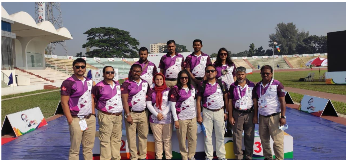
Judges at the Asian Archery Championship in Dhaka, Bangladesh