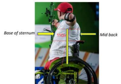
Fig. 1 Measuring half the body width

Some equipment that the athletes are allowed to use will be different as of 1 March 2022. All wheelchair athletes will be allowed to use lateral support whether it is a molded seat back, a protrusion, or the upright of the chair. Lateral support, which is defined as any support given to the side of the athlete above the pelvis, may only be half the width of the athlete’s body. To measure the halfway point, find the base of the breastbone and the spine in the midback and draw a line halfway between them. If the support is behind this line, then it is legal. Anything going beyond the halfway point of the athlete’s body shall not be allowed. (Figure 1) This support must also be 110mm below the armpit of the athlete. This lateral support will not have to be listed on the Classification Card . All wheelchair athletes, whether they are W1 or W2 (they shoot with the Standing archers in the Open Division), may use lateral support.