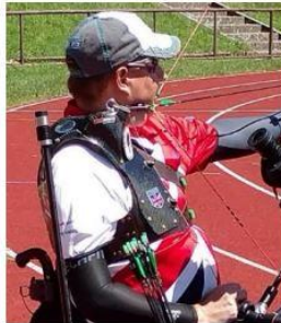
Fig. 4 Legal release aid

The other equipment change is that release aids will no longer be able to function as lateral support or as a rigid corset. A legal release aid will be around the rib cage. Figure 4) Some release aids have been as low as the athlete's pelvis and it has acted as a trunk support when they are shooting. (Figure 5) Since the equipment allowed is to level the playing field and not enhance the athlete's performance, this will no longer be considered legal. Use of a release aid will be found on the Classification Card .