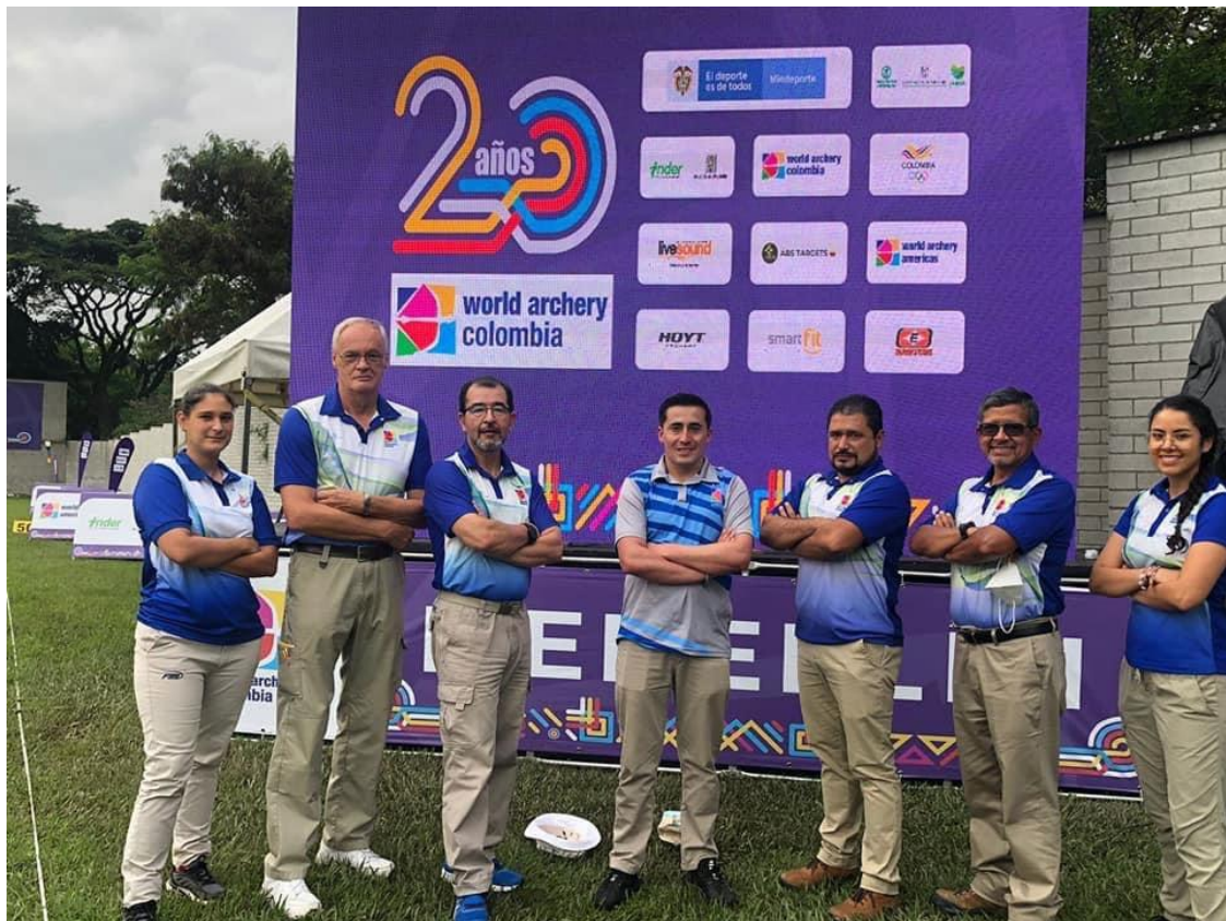
Judges at the World Games CQT at Medellin, Colombia