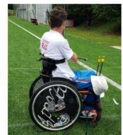
Fig. 3 W2 Strapping

Another change is whether a wheelchair athlete will be allowed to use strapping. Because all wheelchair athletes are allowed to use lateral or side support, not all athletes will need a strap to compete. Over the next few months, the Classification Committee will be deciding who can and can not use a strap. This will be listed on the Classification Card as strapping. W1’s can use any amount of strapping in any position as long as it does not support the bow arm. ( Figure 2) W2’s can use a 5cm strap, wound once their torso horizontally, and 110mm below their armpit.