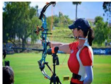
Fig.5 Illegal release aid

The last change is how Visually Impaired athletes will be classified. These changes can be found in Appendix 2 of the Classifier's Handbook .