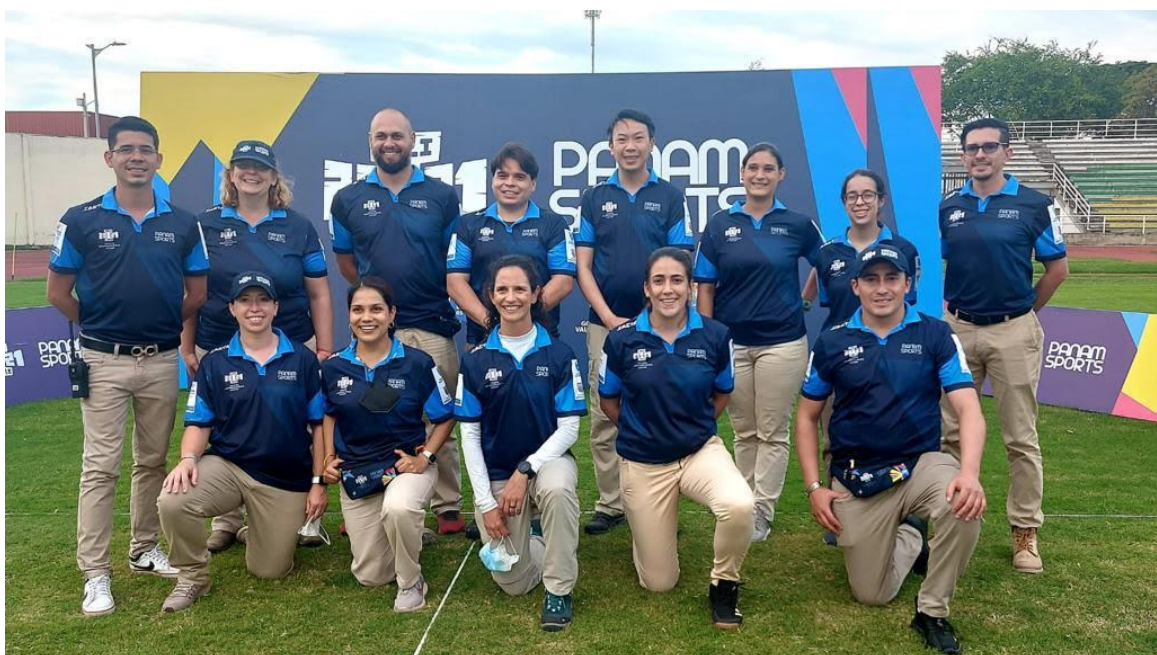
Judges at the Pan American Youth Games at Cali, Colombia