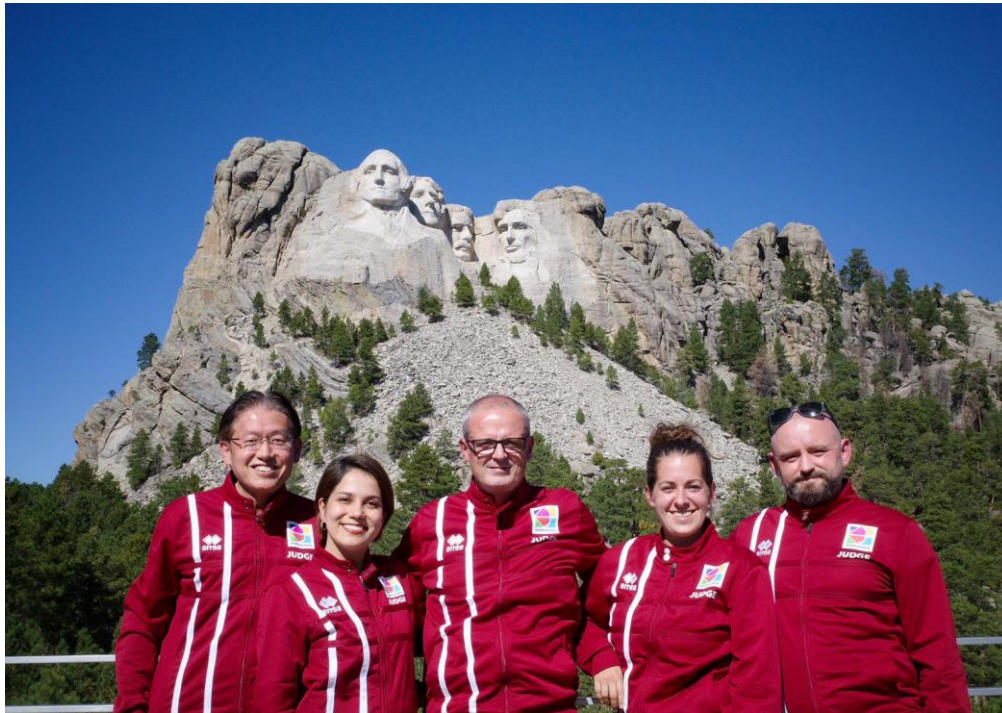
Judges at the Hyundai World Cup Finals in Yankton