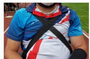
Fig. 2 W1 Strapping

Another change is whether a wheelchair athlete will be allowed to use strapping. Because all wheelchair athletes are allowed to use lateral or side support, not all athletes will need a strap to compete. Over the next few months, the Classification Committee will be deciding who can and can not use a strap. This will be listed on the Classification Card as strapping. W1’s can use any amount of strapping in any position as long as it does not support the bow arm. ( Figure 2) W2’s can use a 5cm strap, wound once their torso horizontally, and 110mm below their armpit.