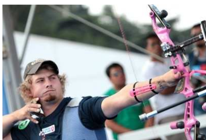
Brady Ellison (USA)