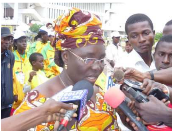
Media and the Director of the cabinet of the Sports

The success of this tournament pleases the "Fondation Internationale de Développement du Tir à l'Arc" (FIDTA), which sponsored this project. For more information: www.febeta.org