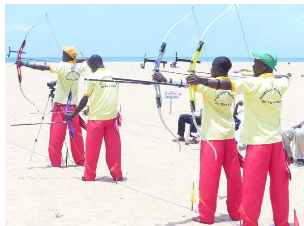
Recurve final on the beach