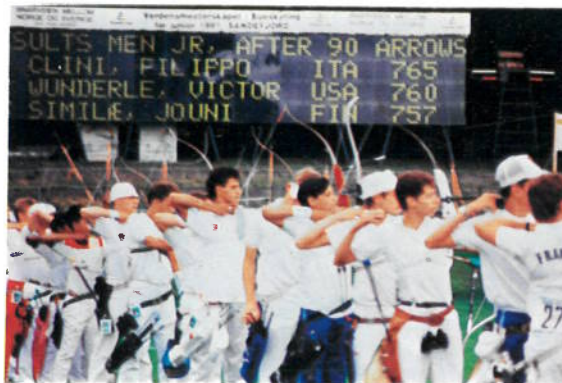
Electronic scoreboard worked perfectly. Congratulations to the organizers.