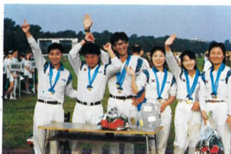
Korea won Men's and Women's Team Finals.