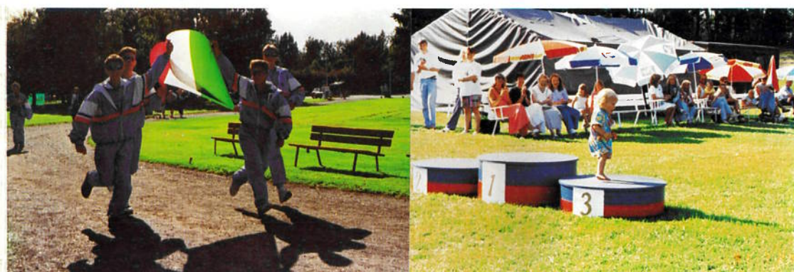
The Italians are celebrating the victory and the flag is running around the field.