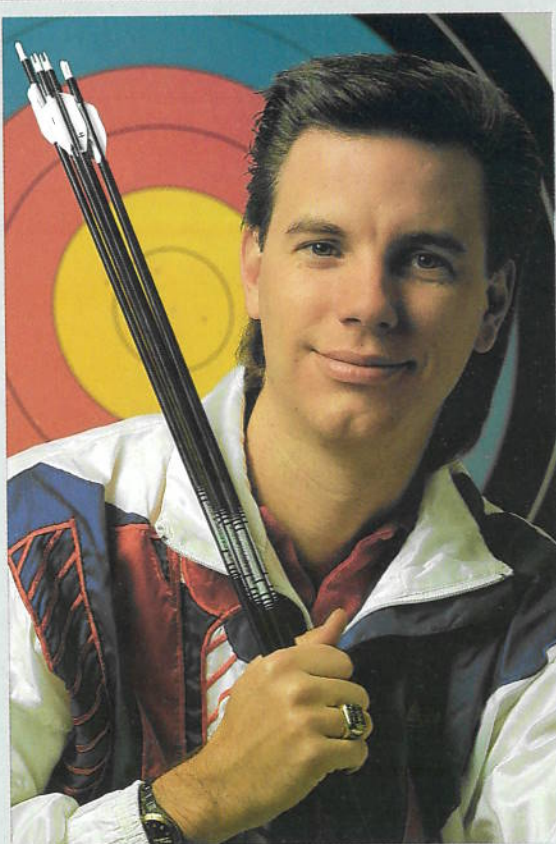
Jay Barrs was the 1987 Pan-Am Champion, and the 1988 National Champion in Field, Target and Indoor.

Now move out to 70 or 90 meters and shoot six 6-arrow ends. Chart them on a small target face. Add one-half turn of tension to the plunger and shoot six more ends, charting them on a separate target.