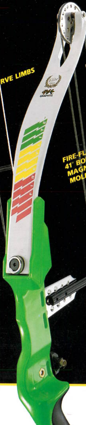
FIRE-FLITE 41" BOW LENGTH MAGNAGLASSIGRAPHITE MOLDED LIMBS (patented)