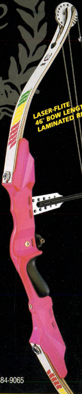
LASER-FLITE 46" BOW LENGTH LAMINATED RECURVE LIMBS