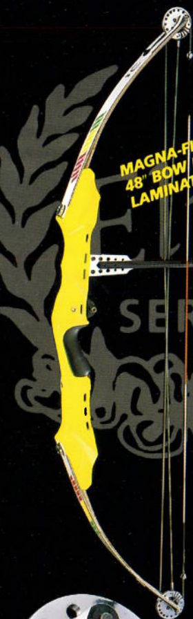
MAGNA-FLITE 48" BOW LENGTH LAMINATED LIMBS

See the real PSE SOLAR-GLO at your authorized PSE dealer.