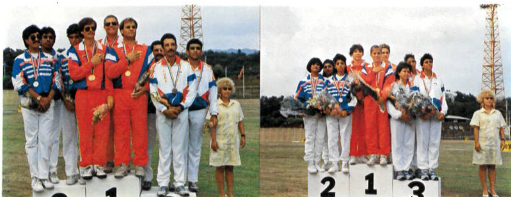
Teams' Awarding Ceremonies:

The quality of competitors coming from Mexico, Cuba and Brazil has increased dramatically over the last few years when the reverse seem to be so from Canada. They did not have a Women's team and the Men's team started and finished a dismal last place. 10 years ago it was always assumed they would take a medal, if not Silver certainly a Bronze.