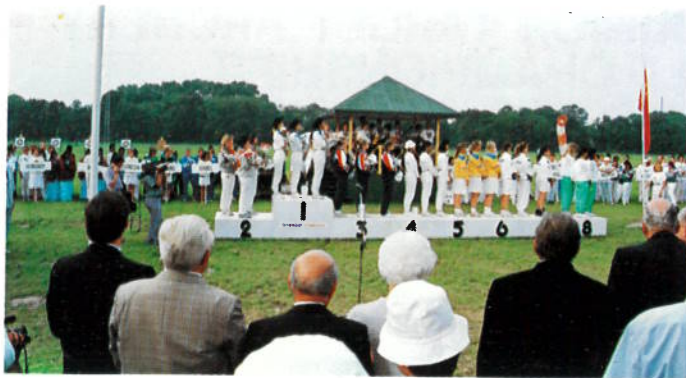
Women's teams' awarding ceremony: 1. KOR, 2. URS, 3. USA, 4. PRK, 5. TAI, 6. SWE, 7. NED, 8. TUR