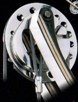
VECTOR ECCENTRIC PROGRAMMED POWER VECTOR PROTOTYPE PICTURED