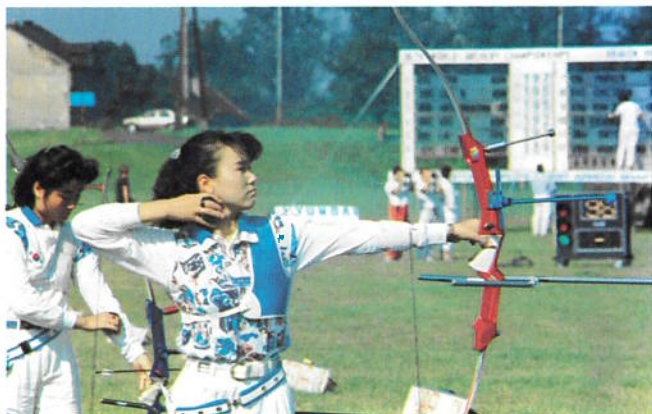
KIM Soo-Nyung (KOR)

place in the Individual Event. This was an unsatisfactory result for her and Korean archery fans.