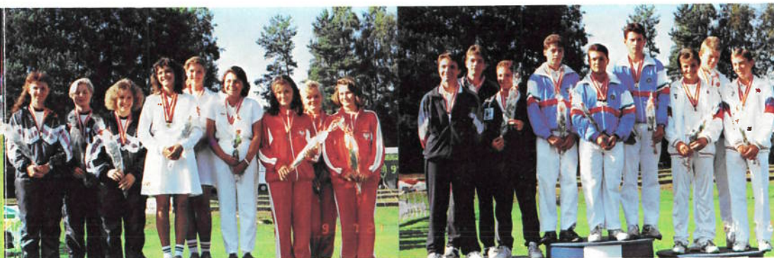
Teams' Awarding Ceremonies:

When we select members of our team for FITA championships, as well as for international tournaments we take into consideration all moments important for the success. The result at that point doesn't play the most important role. We consider some other facts too, like for example, physical condition, sense of responsibility towards the team, positive effect at the others, discipline and continuity in practice as well as the stability of results or positive tendency in achieving results. This time when they won the gold medal this team achieved "their" results and the success was attained. During 1990, I even managed to have six juniors to shoot over 1275 points. It was a starting point for the success attained in 1991. Girls