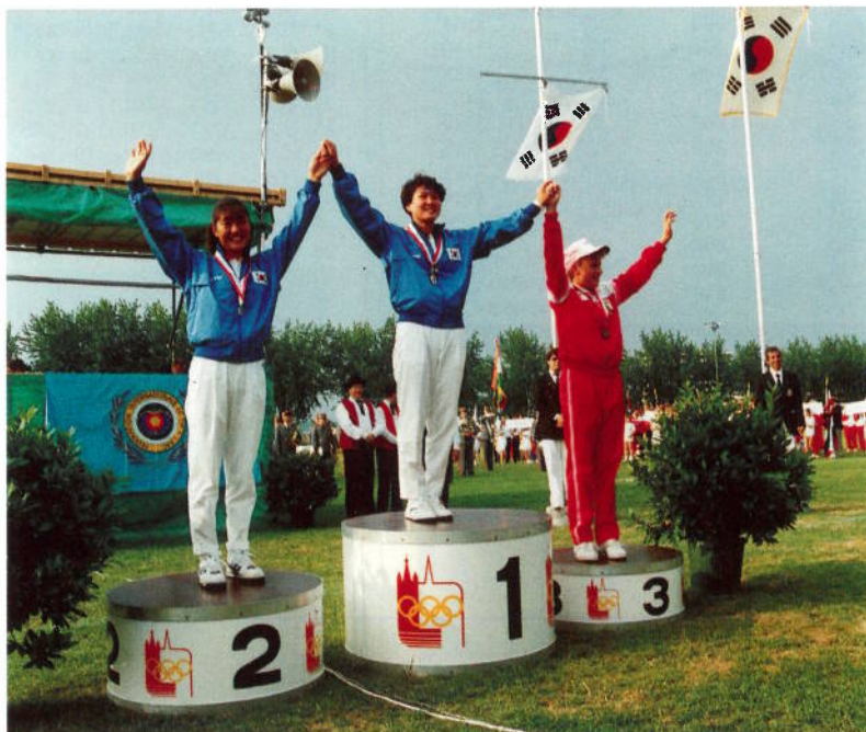
An all-conquering Korean team