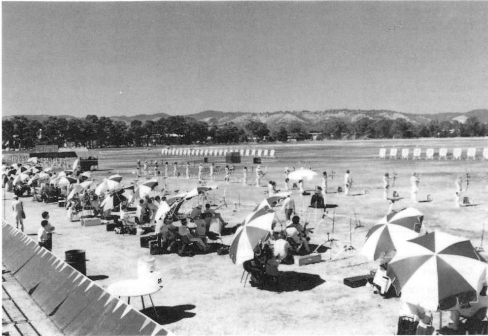
The Shooting field as seen, from the tribunes.