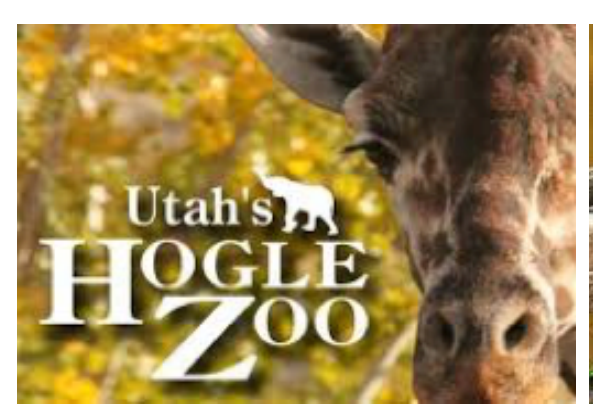
Utah's Hogle Zoo dates from 1931 and is located at the mouth of Emigrations Canyon. Its natural terrain covers 42 acres of tree-lined pathways where visitors can view over 800 animals.