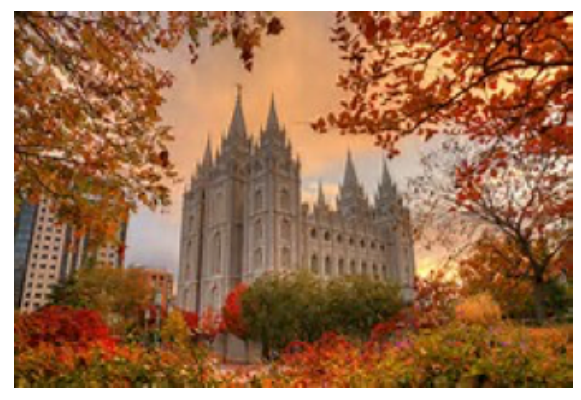
LDS Temple Square, you'll be immersed in 35 acres of enchantment in the heart of Salt Lake City. Whether it's the rich history, the gorgeous gardens and architecture, or the vivid art and culture that pulls you in, you'll be sure to have an unforgettable experience.