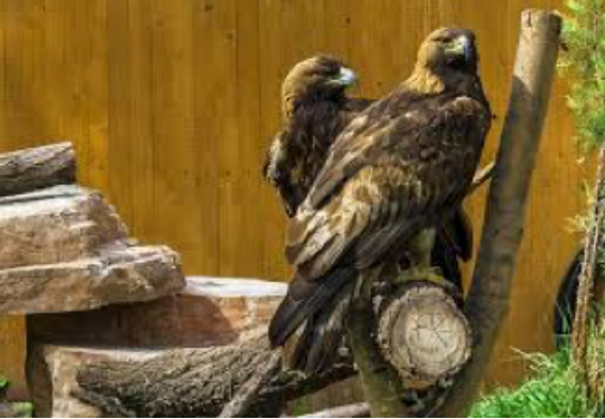
Tracy Aviary inspires curiosity and caring for birds and nature through education and conservation.