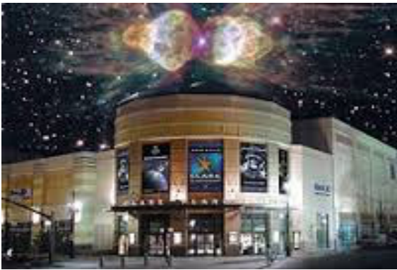
Clark Planetarium's mission is to create and present enlightening experiences that inspire wonder in learning about space and science, and to promote greater public awareness of the science in our daily lives.

Discovery Gateway children's museum is located in the Gateway Mall in downtown Salt Lake City. Discovery Gateway offers 60,000 square feet of interactive, hands-on fun. Come explore our engaging workshops, programs, and exhibits that invite the whole family to create, learn, and play together!