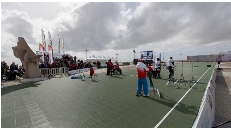
European Championship 2016 – St Jean de Monts (FRA)