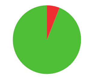
9.4 AVERAGE ARROW (TWO YEAR PERIOD)