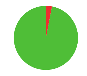
9.7 AVERAGE ARROW (TWO YEAR PERIOD)