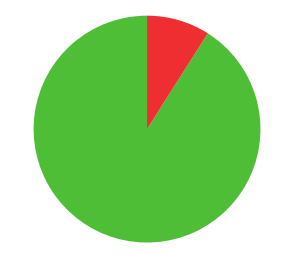
9.1 AVERAGE ARROW

data taken from outdoor archery competitions at 70 metres